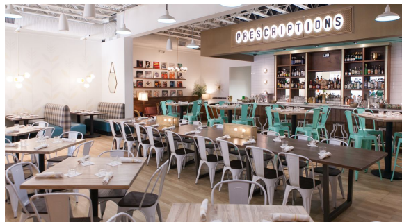
Miller's All Day