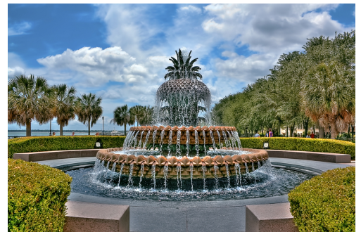
The Pineapple Fountain